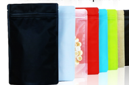
Matte Aluminum Foil Bag Both Sides