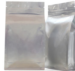
Aluminum Foil Bag Both Sides

Advantage: Easy to use, pack the goods and seal the Zip Lock by hand (optional to seal by heat seal machine)