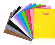
Die Cut(Shopping) Bag