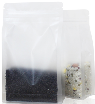
Transparent (Both Sides)

Our MOQ is normally 10000pcs for Plastic Bag Customized Order, sure lower quantity is also accepted with a little higher cost.