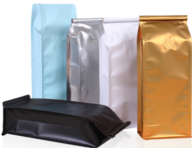
5 colors in stock(with absorb bar) Black, White, Gold, Pink, Blue,