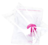
Self Adhesive Bag

As it is single layer material it can be only made mainly 3 kinds bag as follows: