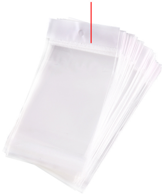
Self Adhesive Header Bag