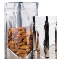
Aluminum Foil Bag One Side Aluminum Foil One Side Transparent