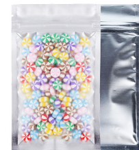
Matte Aluminum Foil Bag Both Sides