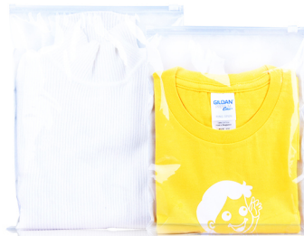
PVC (Matte or Clear)

Our MOQ is normally 10000pcs for Plastic Bag Customized Order, sure lower quantity is also accepted with a little higher cost.