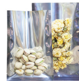
Aluminum Foil Bag One Side Aluminum Foil One Side Transparent