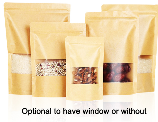
Optional to have window or without

Advantage: Easy to use, pack the goods and seal the Zip Lock by hand (optional to seal by heat seal machine)