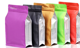
Matte Aluminum Foil Bag Both Sides