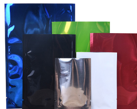
Aluminum Foil Bag Both Sides

Advantage: easy to use and you only have to seal it with a heat seal machine after packing