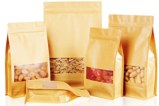
Optional to have window or without

Advantage: Easy to use, pack the goods and seal the Zip Lock by hand (optional to seal by heat seal machine)