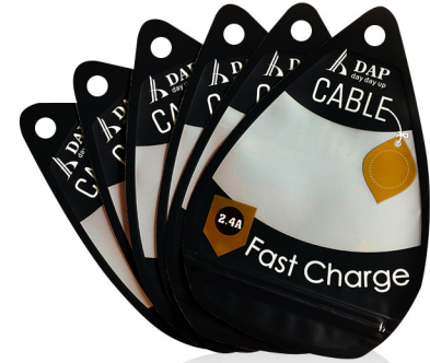
Irregular Shape Bag