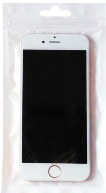
Pearl Film + Transparent