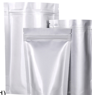
Aluminum Foil Bag Both Sides