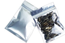
Aluminum Foil Bag One Side Aluminum Foil One Side Transparent