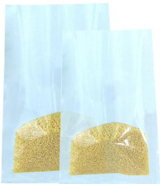
Transparent (Both Sides)