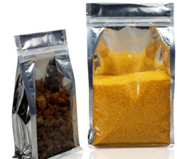
Aluminum Foil Bag One Side Aluminum Foil One Side Transparent