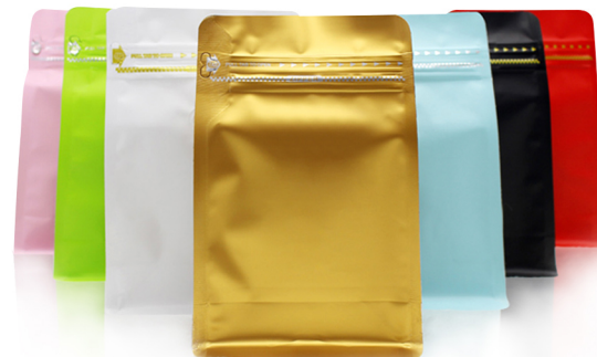
7 colors in stock(with zipper) Black, White, Gold, Pink, Blue, Red, Green

Advantage: Easy to use, pack the goods and seal the Zip Lock(or roll the Absorb Bar by hand (It doesn't need to seal by heat seal machine as it has valve)