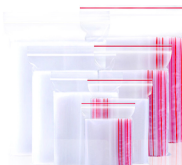
PE Zipper Bag