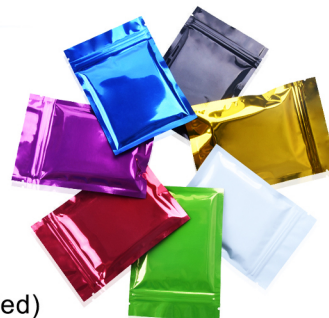
Aluminum Foil Bag Both Sides

Advantage: Easy to use, pack the goods and seal the Zip Lock by hand (optional to seal by heat seal machine)